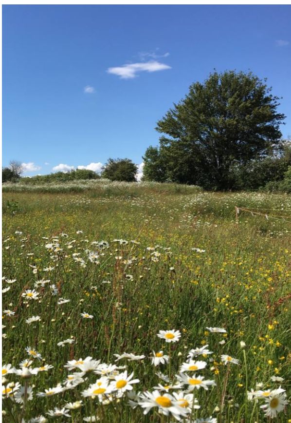
New habitat created at Finham Brook

We are also undertaking an ambitious project to relocate ancient woodland soils to nearby sites. This will enable us to recreate the conditions of ancient woodlands and create new habitats for local wildlife. In addition, our £7 million Woodland Fund is helping local landowners to restore existing ancient woodlands and create new native woodlands.